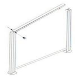
Step 6 Fit top rail and screw into position.

Screw the bottom rail (55mm high x 60mm wide U channel) into position allowing 650mm overall for concreting into ground and the lower rail to sit around 50mm above ground level